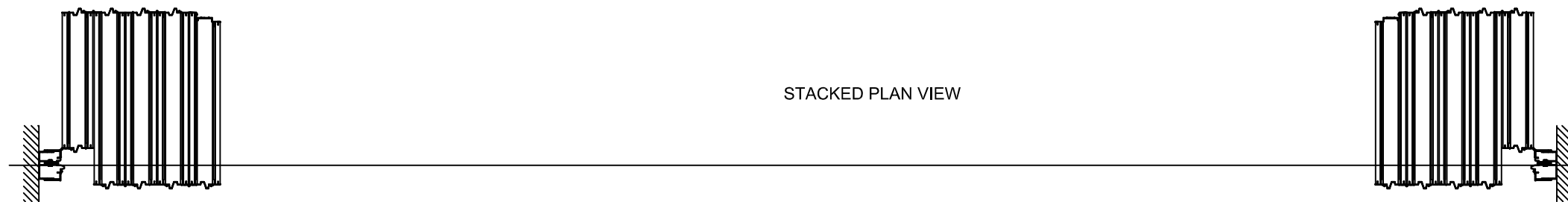
STACKED PLAN VIEW

accordial acoustic movable wall systems Accordial House 35 Watford Metro Centre Tolpits Lane Watford, WD18 9XN. Tel: 01923 246600 Fax: 01923 245654