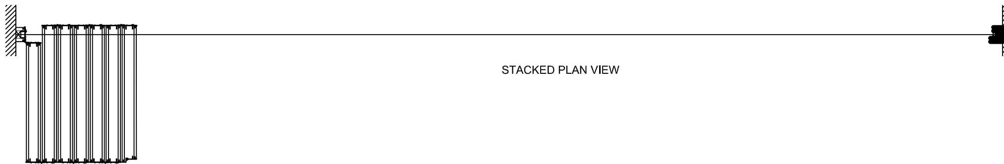
STACKED PLAN VIEW