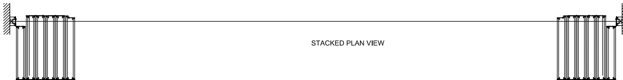
STACKED PLAN VIEW

accordial acoustic movable wall systems Accordial House 35 Watford Metro Centre Tolpits Lane Watford, WD18 9XN. Tel: 01923 246600 Fax: 01923 245654