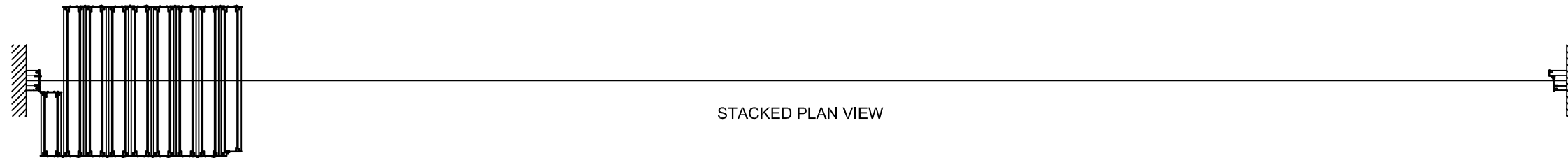
STACKED PLAN VIEW