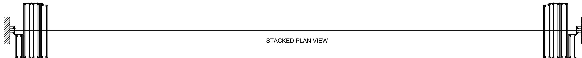
STACKED PLAN VIEW

accordial acoustic movable wall systems Accordial House 35 Watford Metro Centre Tolpits Lane Watford, WD18 9XN. Tel: 01923 246600 Fax: 01923 245654